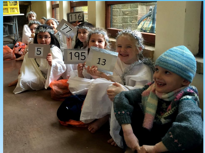
School Links Children from St James School celebrating Christmas