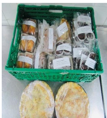
Baking by students from Bridgwater & Taunton College

We would like to say a very big thank you to all of our donors, some of whom have donated £10 a month for over 10 years – your support has been important in covering our day-to-day expenses. Thank you also to those of you who support our centre with donations via our CAF donation site. The Charity Aid Foundation handle your donations and collect Gift Aid on our behalf.