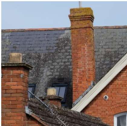
The roof of Open Door showing traces of ingress

Open Door day centre is housed in a grade 2 listed building that dates back to the 1880s, and the Charity is responsible for the good repair of the building. A recent building survey has revealed that we need to make major repairs to the roof of the building. After carrying out emergency repairs, we need to raise £50,000 to complete the major structural work including structural timbers, chimney repairs and replacement roof membrane.