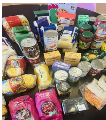
Food donated by a local church

Thanks to those of you who bring food and clothes to the centre. We have a list of items we need that can found on our website.